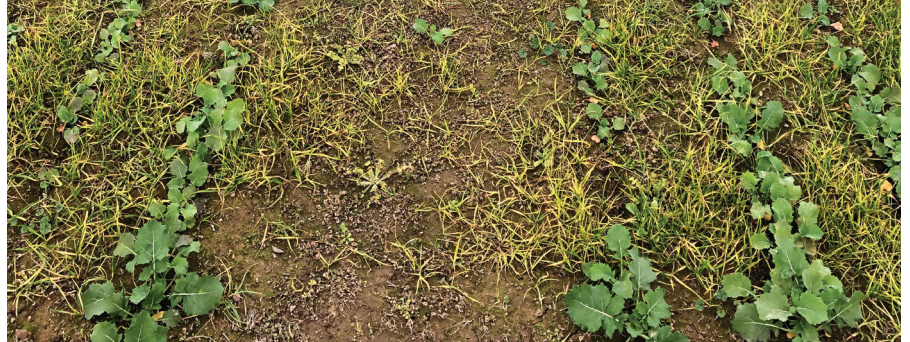
Liberty herbicide symptoms, BASF trial site Mangoplah 2019

Even though the ryegrass in this trial is showing such clear effects two weeks after Liberty was applied at 2 L/ha, many plants would recover without the follow-up spray in that 7–14 day window.