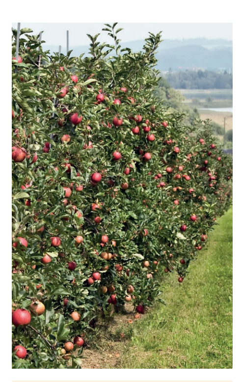
Crops Apples and cherries

Regalis Plus is a uniquely targeted growth regulator that reduces shoot growth in apples and cherries to simplify crop management, increase yields, and produce great-looking fruit. A more open canopy also makes it easier to achieve good spray coverage and maximise the value of crop protection products.