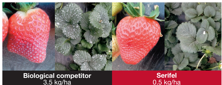
Biological competitor 3.5 kg/ha